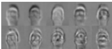
Figure 1. The first ten eigenfaces computed from our training collection

The eigenfaces algorithm operates on gray images and a collection of training faces [Tur91]. We have prepared a collection of training faces that consists of 64 images. While preprocessing, the average image for this collection is computed. Next, this image is subtracted from each training image and placed in the matrix. This matrix is used to create the covariance matrix. The eigenvalues and eigenvectors of such a covariance matrix are then determined. The first 16 normalized eigenvectors, sorted by decreasing eigenvalue represent subspace in which classification at run-time phase is performed. The eigenfaces are normalized eigenvectors which are the principal components of face space and they reflect the statistical properties of facial appearance. The first ten eigenfaces related to our training collection are shown in fig. 1.