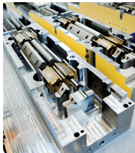
Magnets for the Swedish MAX IV synchrotron.