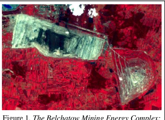
Figure 1. The Belchatow Mining Energy Complex: a) open pit mine, b) dump body and c) power plant

The large scale exploitation causes not only mining and many technological complications but also many of geological, engineering, planning and reclamation