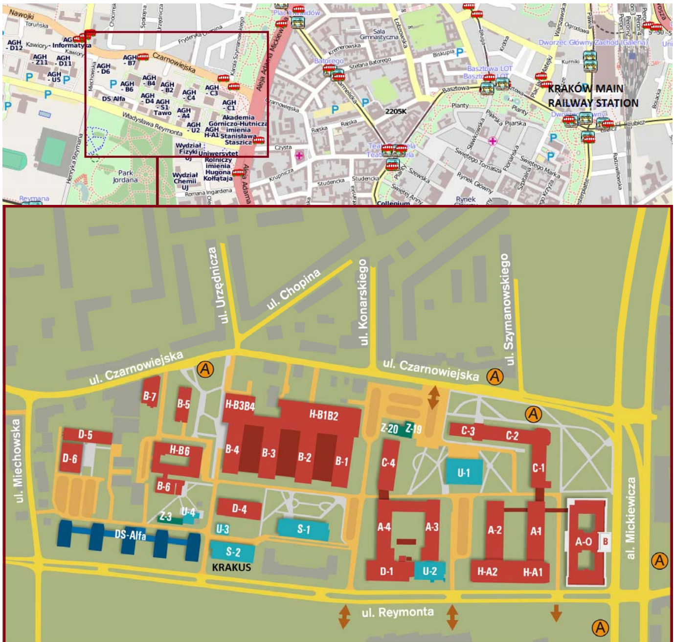
AGH University of Science and Technology

is placed in a close vicinity of the historical center of the City Kraków. Some hotels can easily be reached by foot – see map below. In order to use the Taxi Barbakan it is recommended to go to the platform placed above the railway station (directly from a particular platform by stairs or lift).